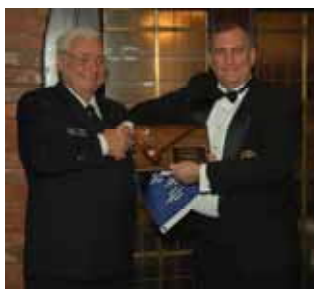
Incoming and outgoing Commanders